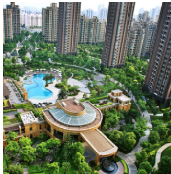
Shanghai, Greentown by PLACE Design Group

As one of seven winners at the awards and the only urban design and planning practice to be recognised, PLACE Design Group boasts 10 offices across Australia, China and South-East Asia with over 180 staff.