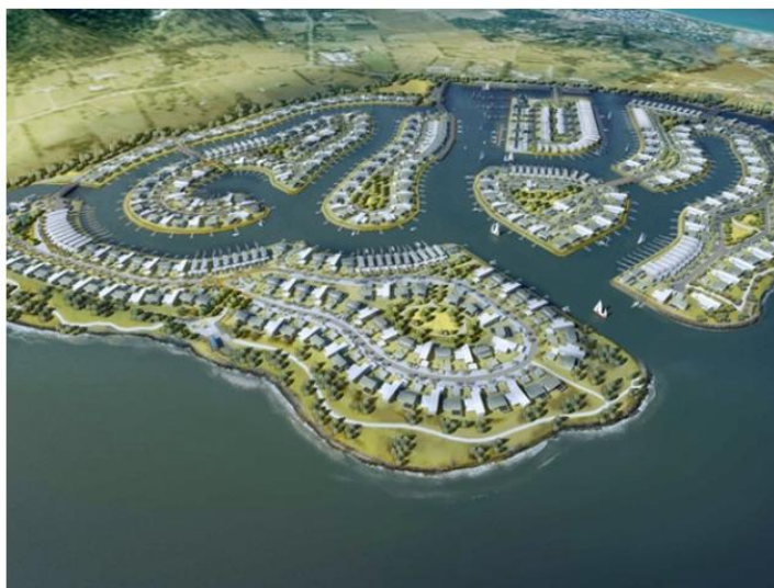
Lauderdale Quay, Tasmania

2014 Hills Young Australian Design Awards winners announced