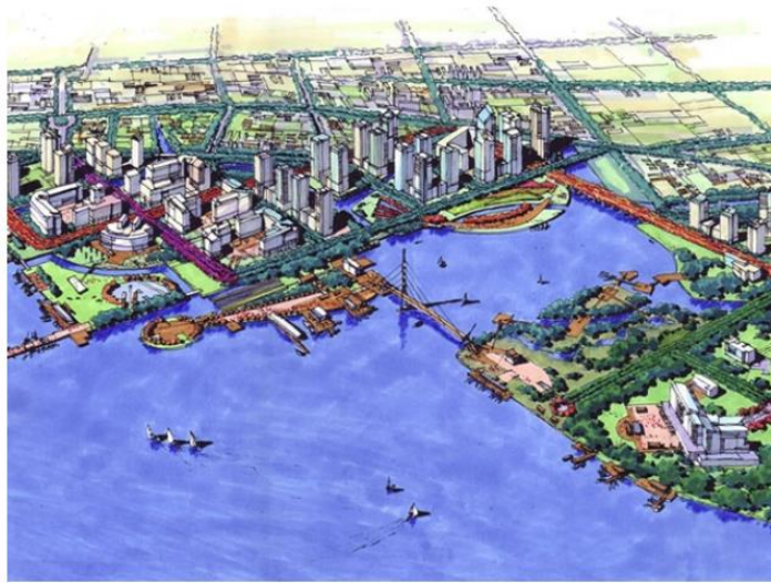
Wuxi Swan Lake

Sustainability is at the fore for this practice, which seeks to incorporate environmental best practice underpinned by New Urbanism and Place-Making principles into all its projects.