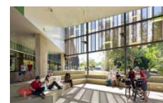
Wilson Architects Top The Class With Cutting Edge