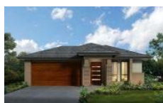
Buyers Look To Trade Up In The Outer Suburbs