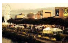
South Bank Cultural Centre: Development Progress Vs