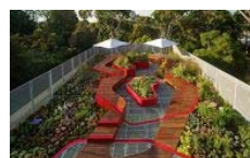
Australian Landscape Architecture Festival