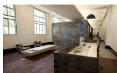
Leading Architecture Firms Showcase Work For Brisbane